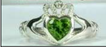
In honor of St. Patrick's Day and showing our “Stone of the Month”

Peridot is a wonderful greenish stone for usually a reasonable price. And, even better, a large supply is mined in the USA, namely Arizona. While Arizona supplies the majority of Peridot, other locations include Burma and Pakistan. Burma has traditionally been considered to have the best color of green.